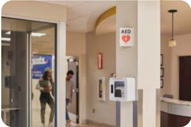
Warsaw Community Schools

"I had just received the Avive Connect AED that was supposed to travel with me to different locations, or travel with me on my golf cart here at the high school, roughly two hours prior to the incident. "