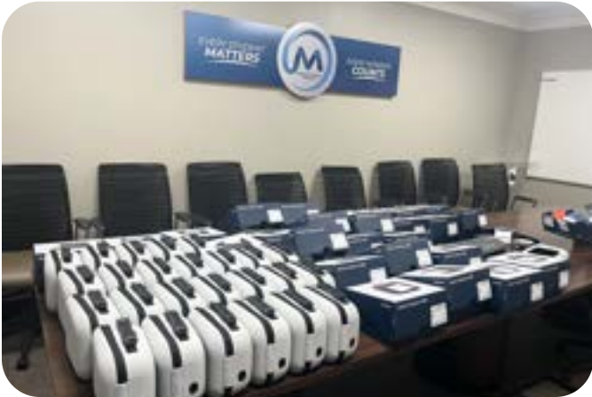
Morgan County Schools

Athletic trainers now bring AEDs directly to games and practices, ensuring that help is never far away.