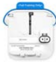
Avive AED Training Cartridge