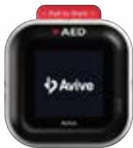
Avive Connect AED®