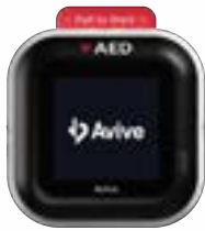
Avive Connect AED®

Optional: REALConnect™ software subscription is free for the first year, $199/year thereafter.