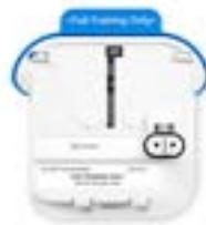
Avive AED Training Cartridge