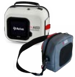
Choice of Semi-Rigid Carrying Case or Responder Bag