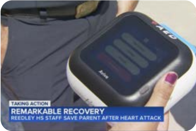
Reedley High School