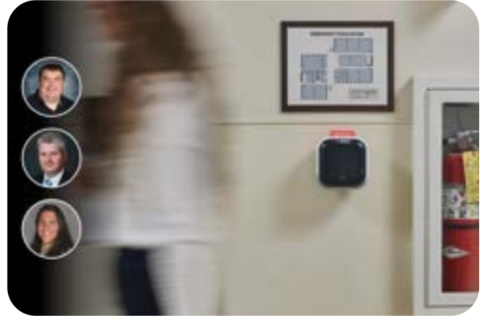
Avive LIVE: Creating safer campuses with AEDs.