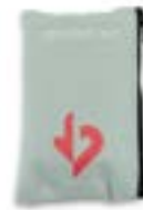
Avive CPR/AED Rescue Kit