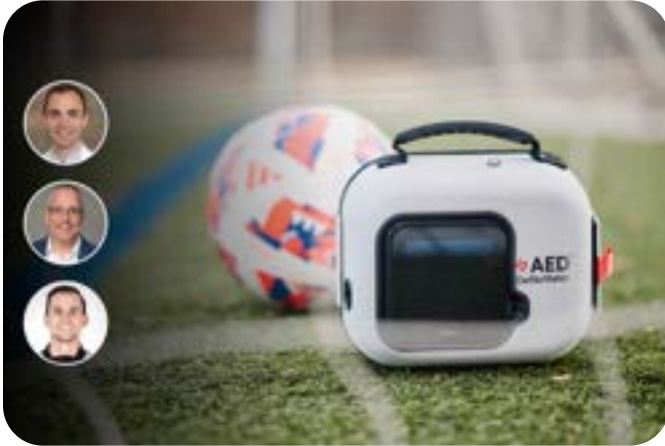
Avive LIVE: Behind the scenes of saving lives in sports.